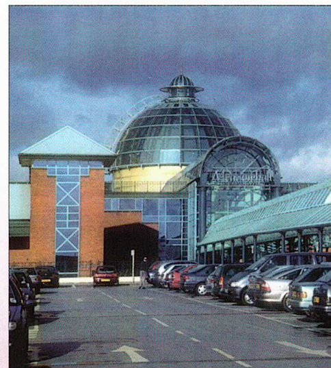
Meadowhall Shopping Centre, Sheffield