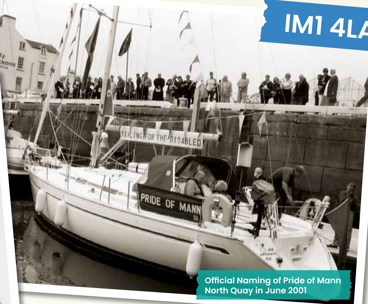
Official Naming of Pride of Mann North Quay in June 2001