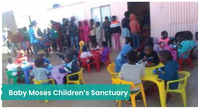
Baby Moses Children's Sanctuary