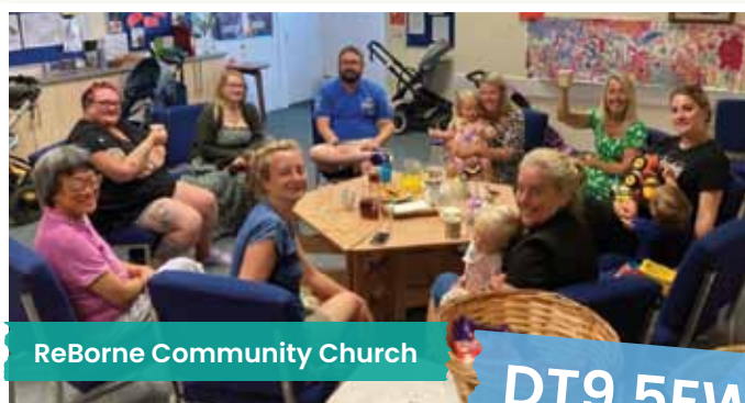
ReBorne Community Church