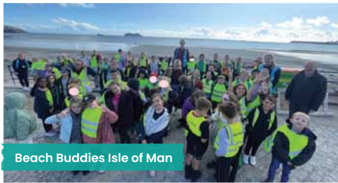
Beach Buddies Isle of Man