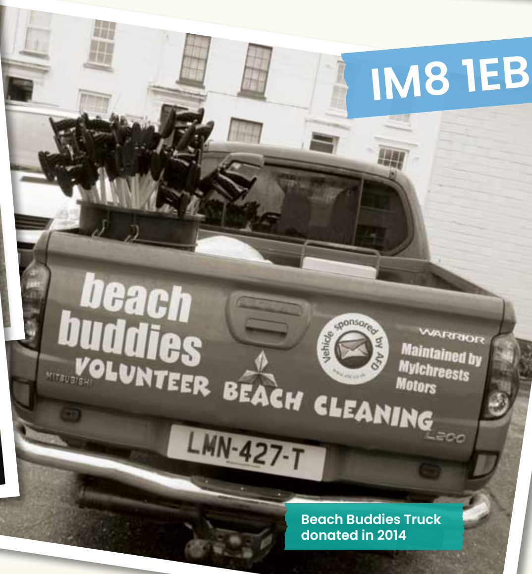
Beach Buddies Truck donated in 2014