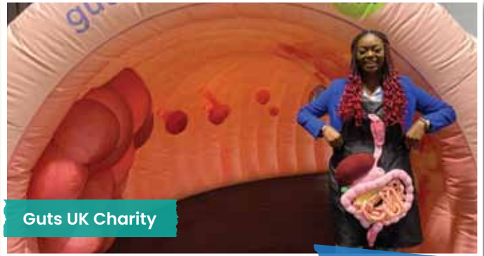
Guts UK Charity