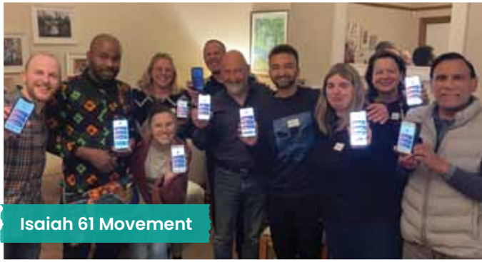
Isaiah 61 Movement