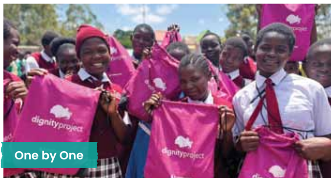
One by One