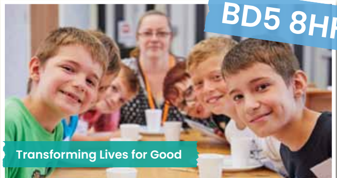
Transforming Lives for Good