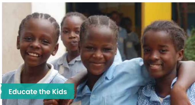
Educate the Kids