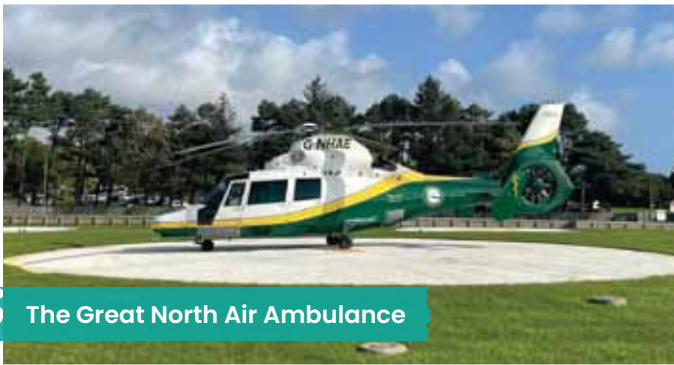
The Great North Air Ambulance